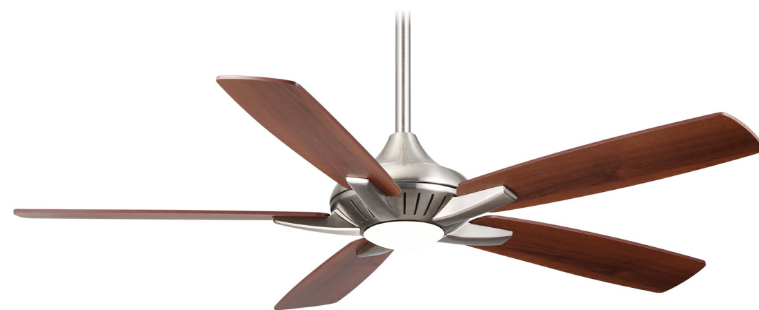
Reversible Blades - Dark Walnut