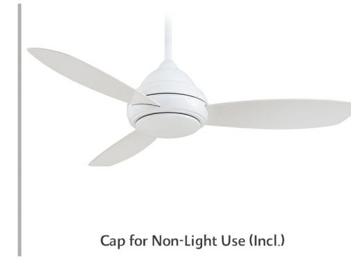
Cap for Non-Light Use (Incl.)